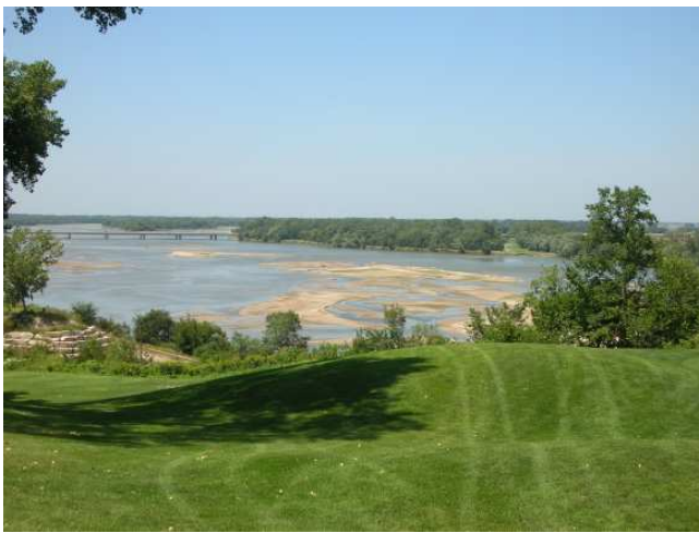
Beautiful Quarry Oaks Golf Course