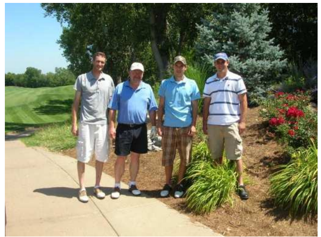
2009 First Flight Winners